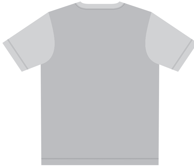
FRONT - MEN