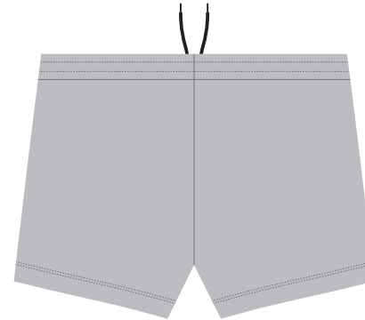
BACK - SHORTS