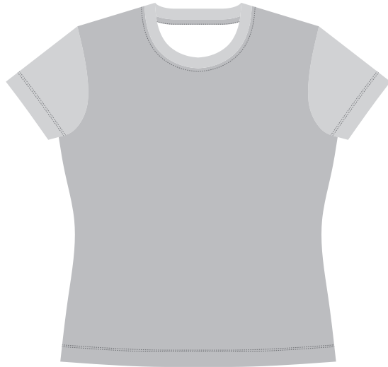
FRONT - WOMEN