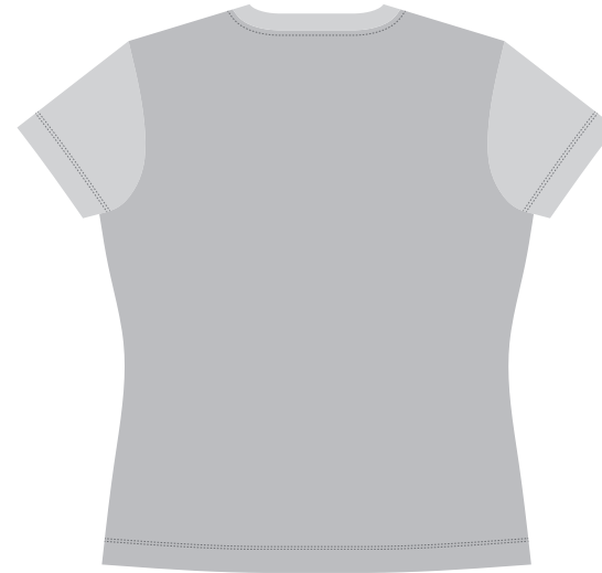
BACK - WOMEN